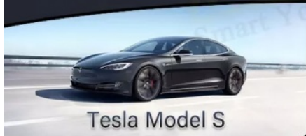
Tesla Model S