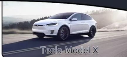
Tesla Model X