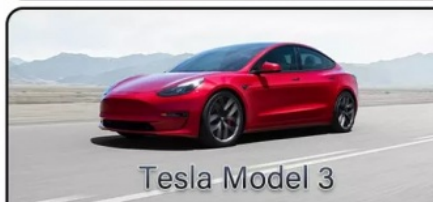
Tesla Model 3