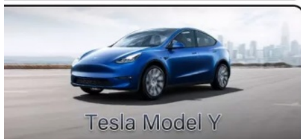
Tesla Model Y